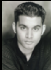
Believe A New Perspective