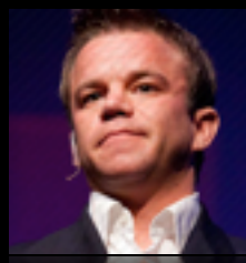
Motivation Bullying Prevention