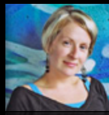
Choices Positive Decision Making